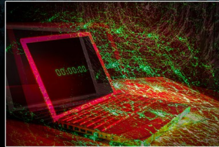
Y2K by DILLON TURNER