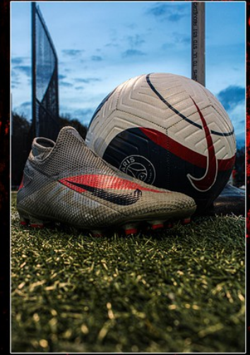
CORNER 3 by NICK SEIBEL