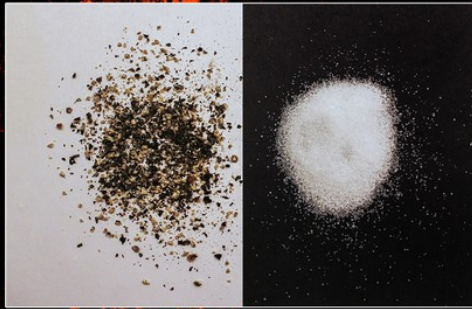
SALT & PEPPER by LOGAN TRAYNOR