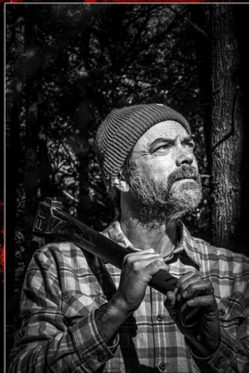
WOODSMAN by MAX PAPALEONI