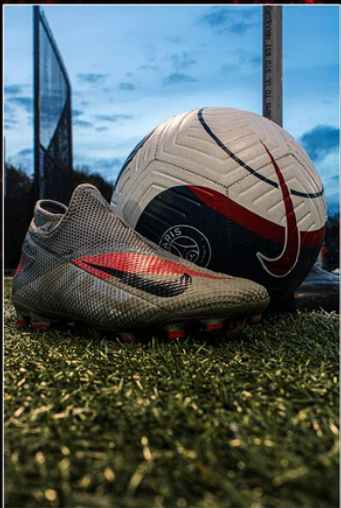
CORNER 3 by NICK SEIBEL