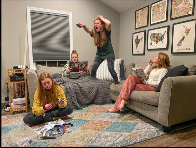
TOO MANY PEOPLE IN THE DANG LIVINGROOM