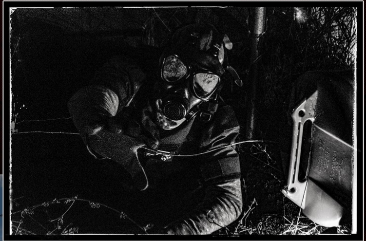
"THIS IS THE END"