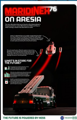
MISSION TO SPACE