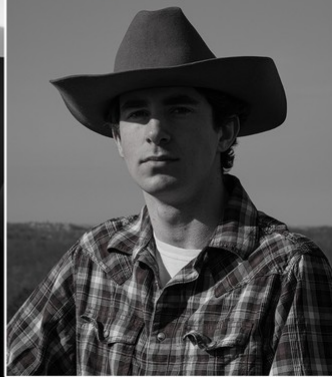
MAN OF THE EAST